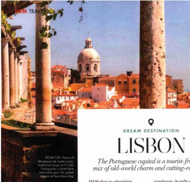
FROM TOP: Views of Miradouro de Santa Luzia; traditional shops at A Vida Portuguesa; custard tarts and white port, the gilded interior of Louis shoe shop

Client: Inspira Santa Marta Hotel Yellow News Source: Hello! Fashion Monthly (Main) Date: 01 September 2016 Page: 110 Reach: 200000 Size: 675cm2 Value: 8802